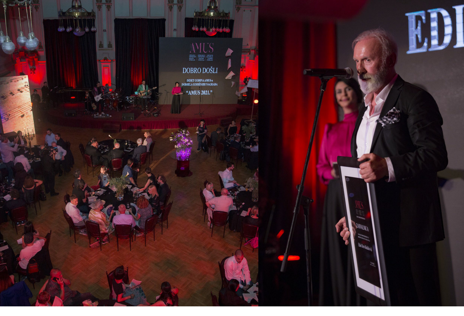
Ceremony held on the occasion of ten years of the license of AMUS

On 22 June 2022, a special ceremony was held in Sarajevo, at the House of the Armed Forces of Bosnia and Herzegovina, on the occasion of the tenth anniversary of the license acquisition by AMUS.